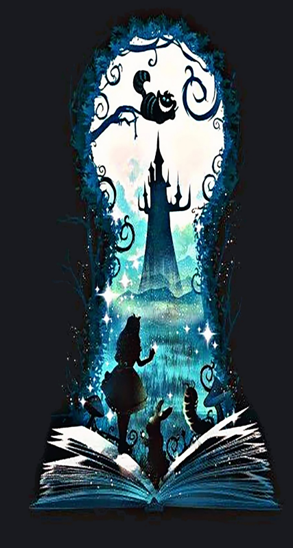
Copyright © 2022 Playbill Online Inc. All marks used by permission.